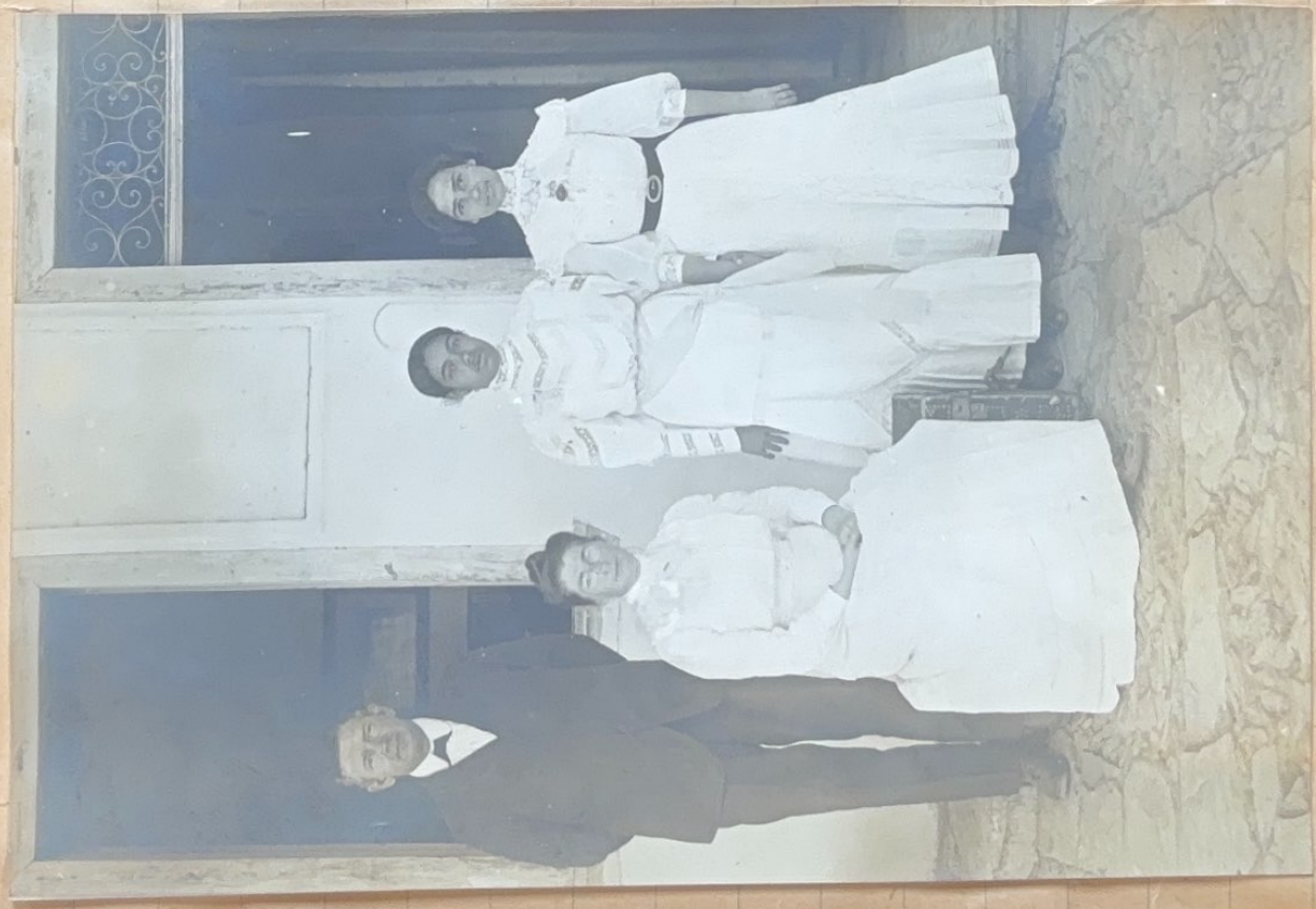
Taken under veranda at front door.

We had in 1911 five classes. One in 5 th primary grade and four in an irregular course which at present has 5 classes but in 1918 will begin on a new 6 class (years) course.